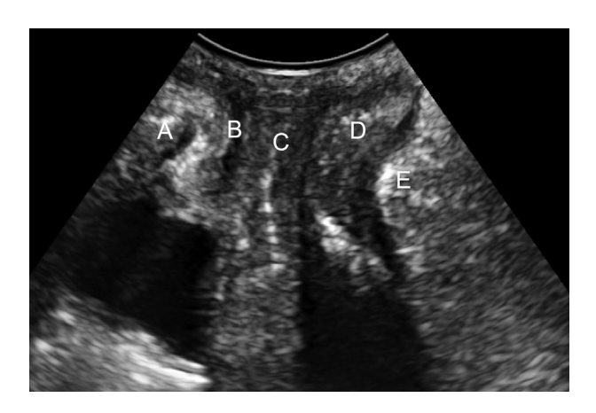
FIGURE 1 Identification of the midsagittal plane on twodimensional transperineal ultrasound, showing the plane on twodimensional transperineal ultrasound and the pubic symphysis (A), urethra (B), vagina (C), anal canal (D), and levator ani muscle (E). (2) Axial plane on four-dimensional imaging at the level of maximal hiatus contraction

at rest and during contraction as co-variables. For all tests, P < 0.05 was considered statistically significant.